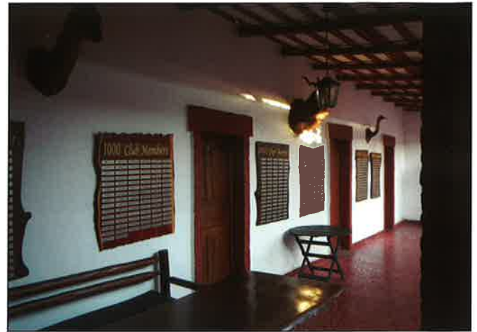
The lodges are lined with plaques, naming those in the “over-1,000” club.

All hunting and shooting is therefore booked through outfitters and conducted out of lodges, such as the two I mentioned. With the millions of doves located in the Cordoba province, the many dove hunting lodges are sure to offer superb shooting. I wish I had the time and resources to try them all. I'm not sure when I'll return (sometime after my shoulder feels better), but I know I will. GT