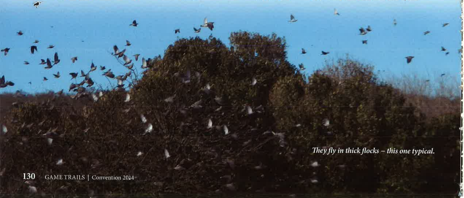
They fly in thick flocks – this one typical.

I joined six other hunters who had been at the lodge for one and a half days already. The previous day these six hunters had shot over 7,500 doves. The walls of Sierra Brava are filled with plaques inscribed with the names of hunters who have shot over 1,000