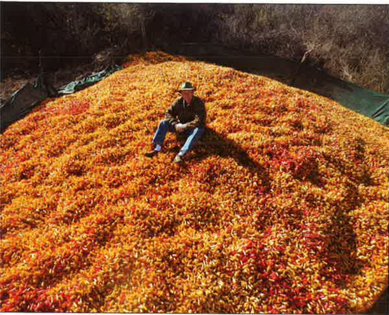
The author on top of a mountain of shells.

My hunt was set for August 2012, not because the shooting is “better” that time of year (the shooting is phenomenal year round) but rather because it fit my schedule. I flew into Buenos Aires main international airport then made a short transfer to the domestic airport for my flight to Cordoba. My hunt was somewhat unusual in that I decided to go to two different lodges – Los Chanares and Sierra Brava, both prestigious Beretta Trident award winners.