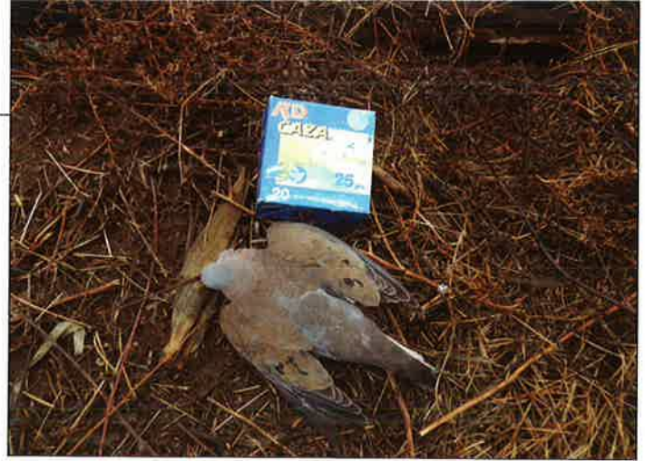
Ammo is provided, usually, and it is possible to bring your own guns or rent a shotgun there.

I elected not to bring my own guns but rather use the guns available at the lodges. This is a personal preference, but the lodges offered both Beretta and Benelli guns in 20, 28, and .410 gauge in both semi-automatic and over-and-under. I considered this a “plus” as it gave me an opportunity to shoot several different guns in an actual hunting environment. I’d also been pre-briefed to expect to shoot three to five cases, 1,500 to 2,500 shells, per day. I wasn’t sure my old guns would hold up to that much “action.”