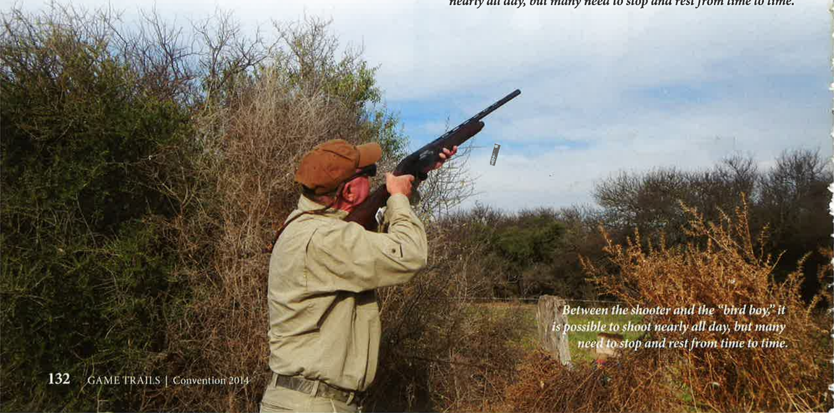
Between the shooter and the “bird boy,” it is possible to shoot nearly all day, but many need to stop and rest from time to time.